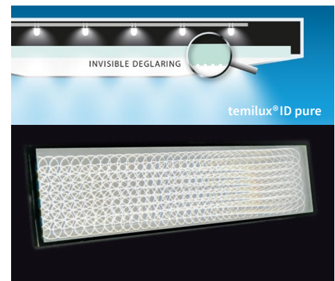
temilux® ID pure